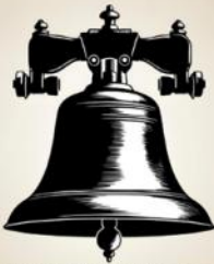
"THE BUXHALL BELL" BAR AT THE VILLAGE HALL